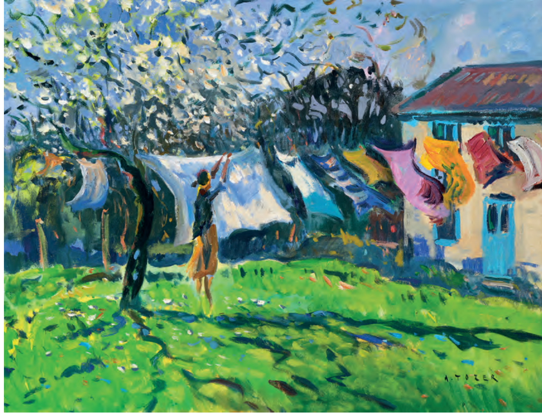
Spring Breeze Acrylic on canvas 24 x 32 inches