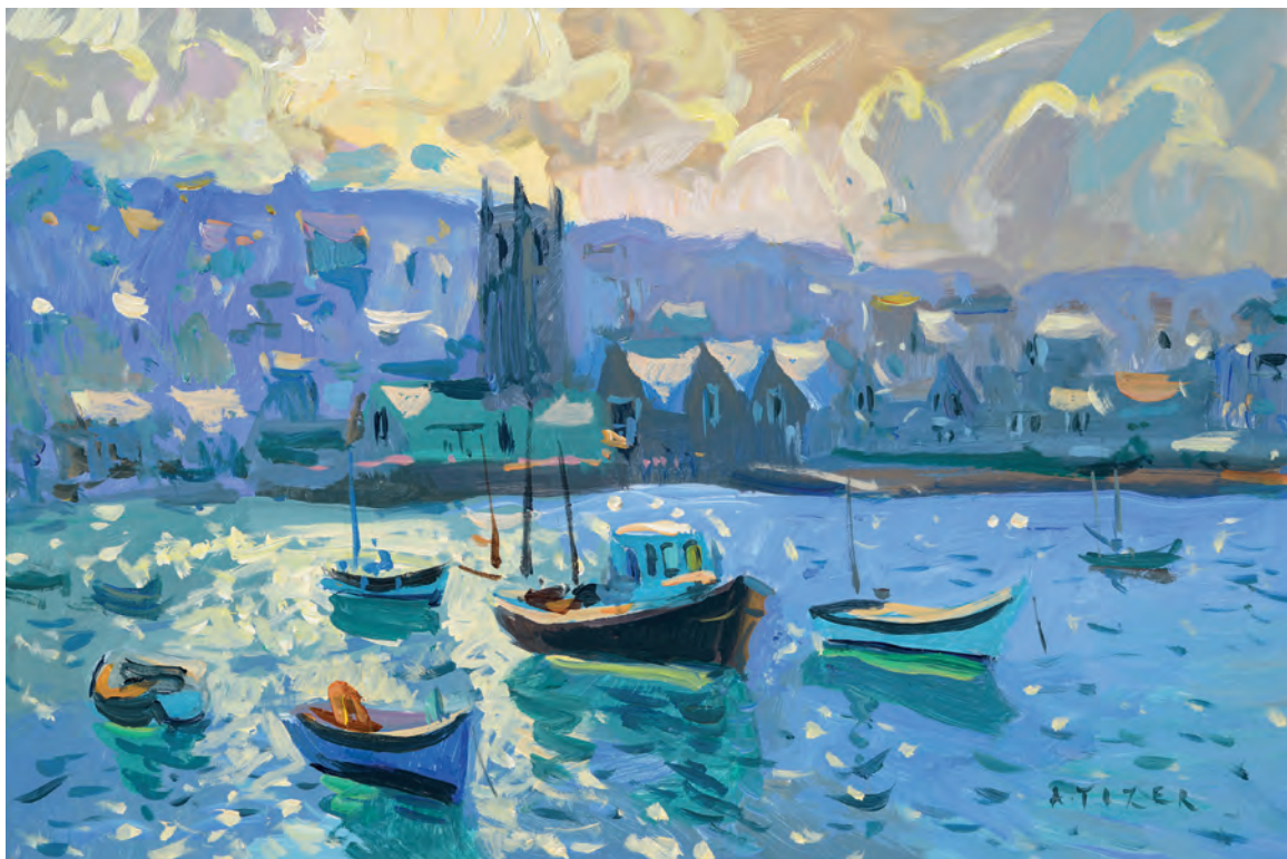
Evening Light, St Ives Acrylic on board 12 x 18 inches