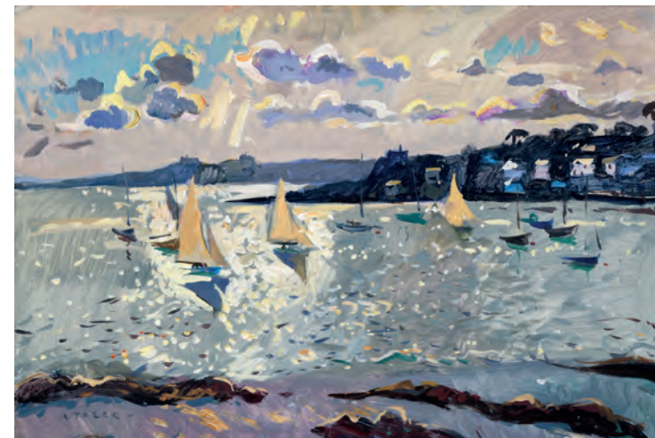
Sparkling Waters, St Mawes Acrylic on board 20 x 30 inches