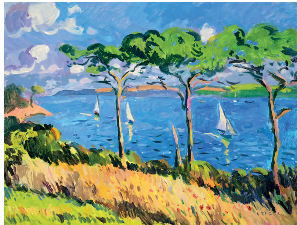
Sails on the Helford River Acrylic on board 24 x 32 inches