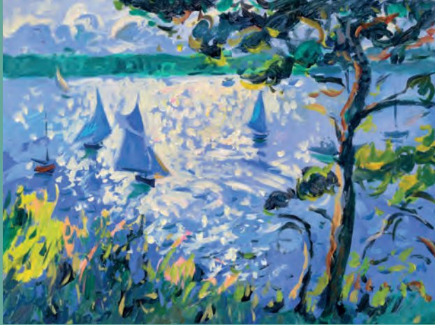
Through the Pines to the Helford River Acrylic on board 12 x 16 inches