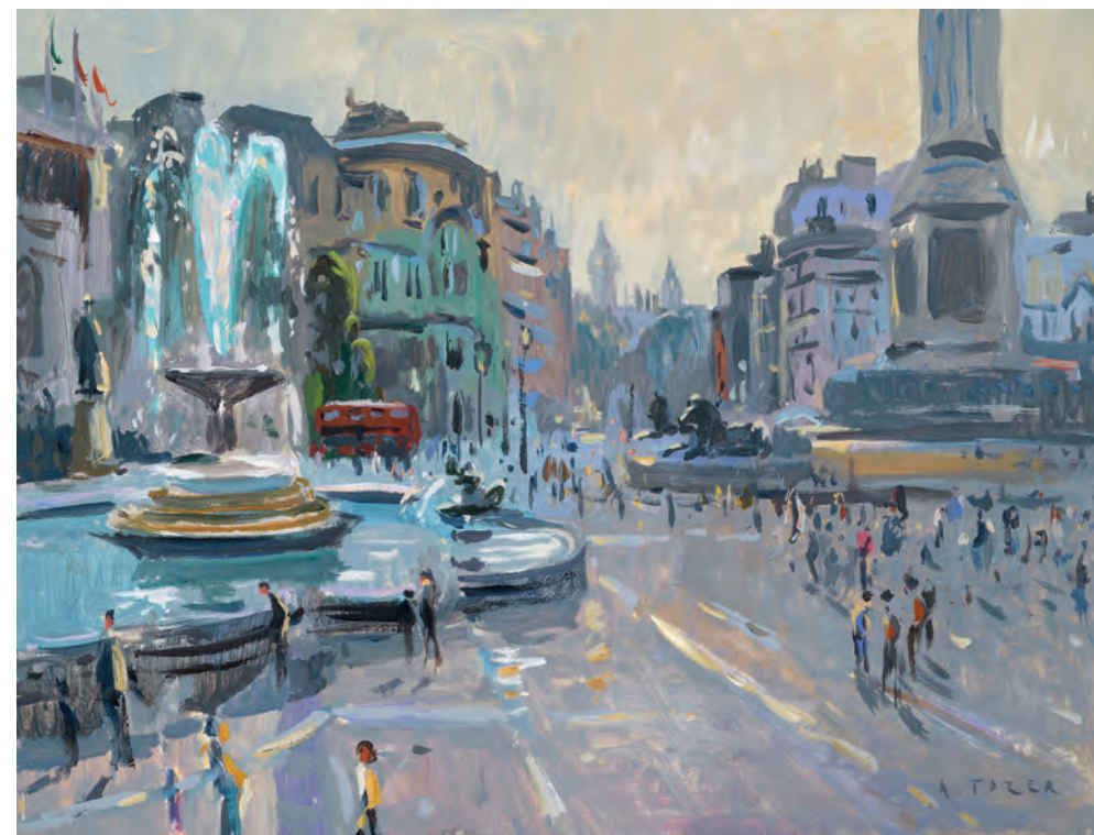
Trafalgar Square, Hazy Light Acrylic on board 18 x 24 inches