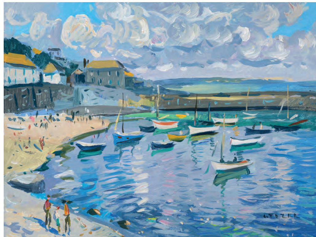
Summer Afternoon, Mousehole Acrylic on board 12 x 16 inches