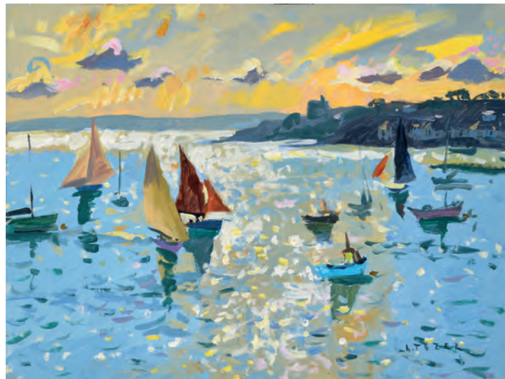
A Golden Evening, St Mawes Acrylic on board 12 x 16 inches