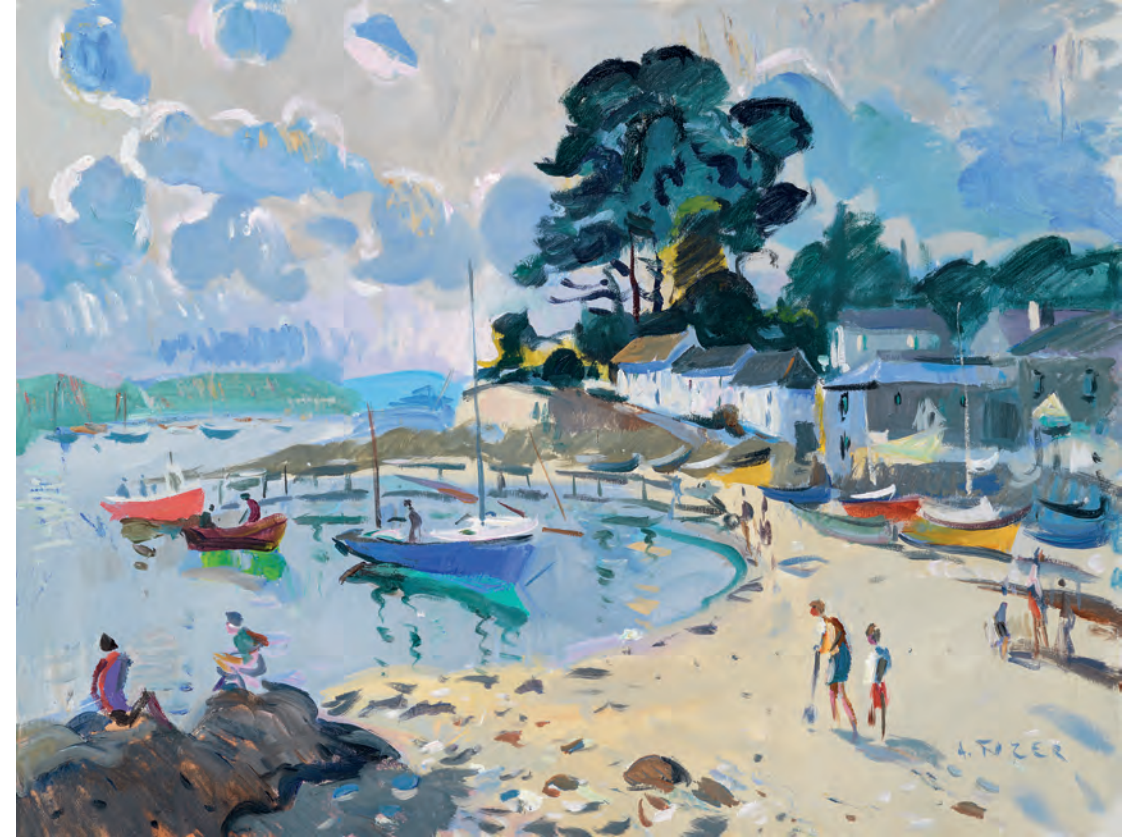
Morning Colours, Helford Passage Beach Acrylic on canvas 24 x 32 inches