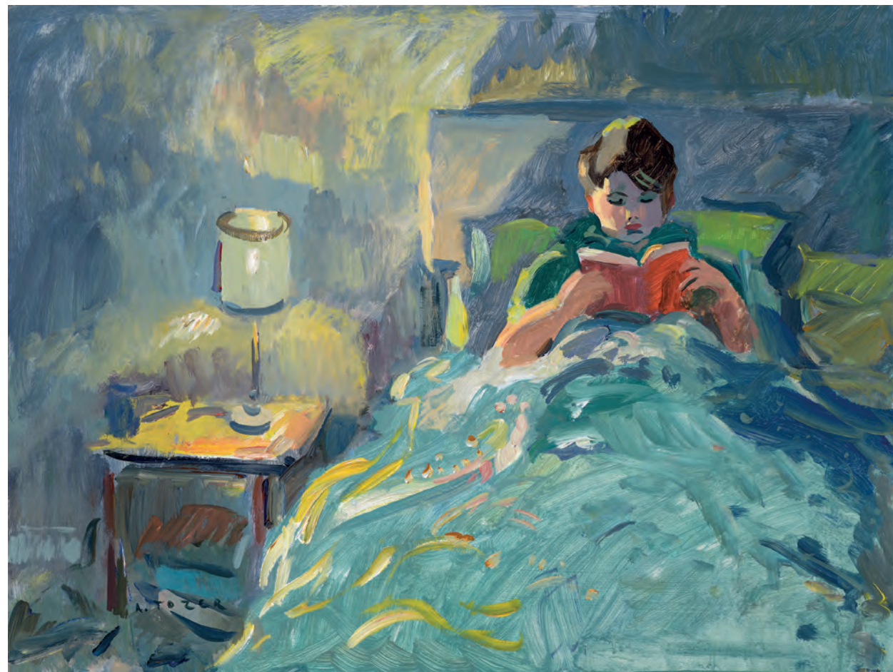
Bedtime Stories Acrylic on board 18 x 24 inches