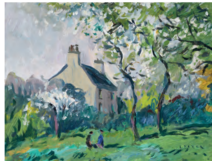
A Cornish Spring Acrylic on board 12 x 16 inches