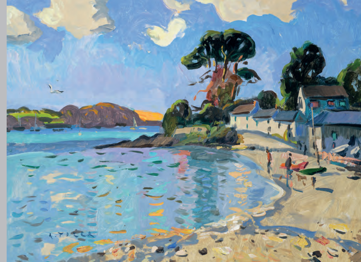
Spring Morning, Helford Passage Acrylic on board 18 x 24 inches