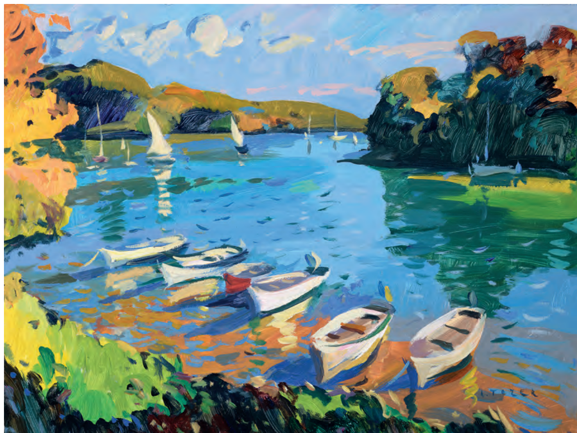
Sails off Port Navas Acrylic on board 18 x 24 inches