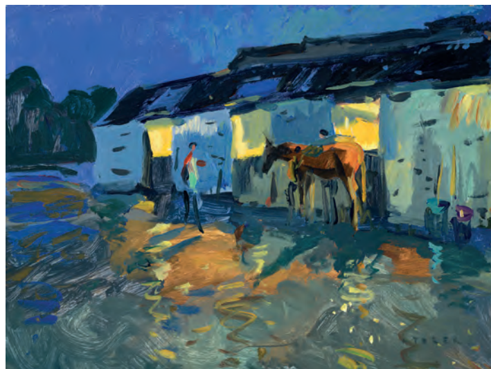
Evening Light at the Stables Acrylic on board 12 x 16 inches