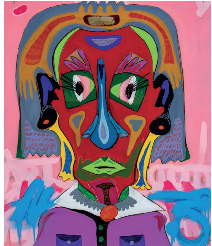
Goddess Mixed media on paper 40 x 33 inches