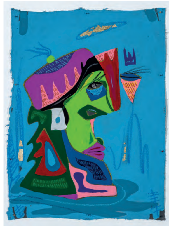
Me, Myself and I - IV Mixed media on canvas 20 x 14.5 inches