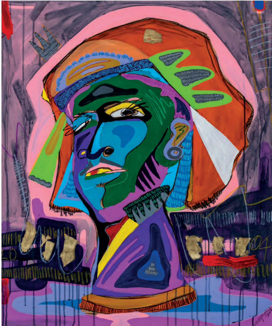
Africa Queen Mixed media on paper 40 x 33 inches