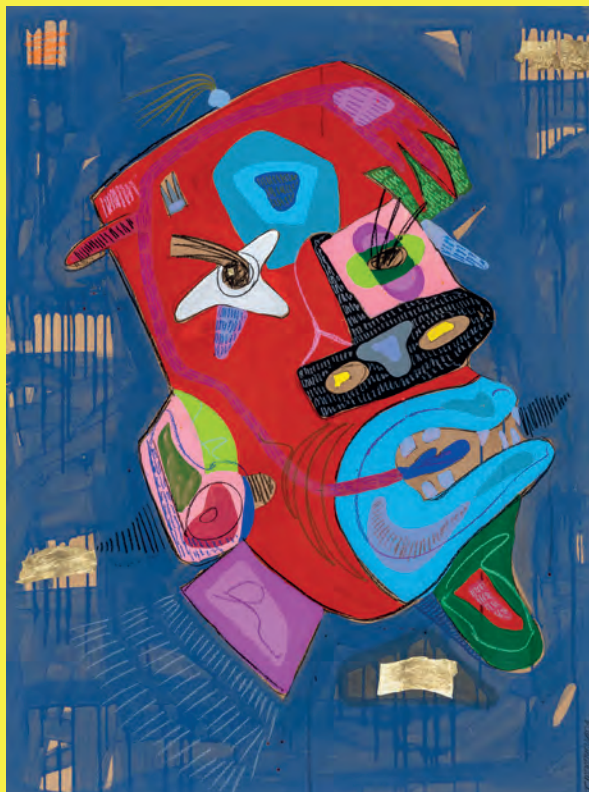
Red Mixed media on paper 40 x 30 inches