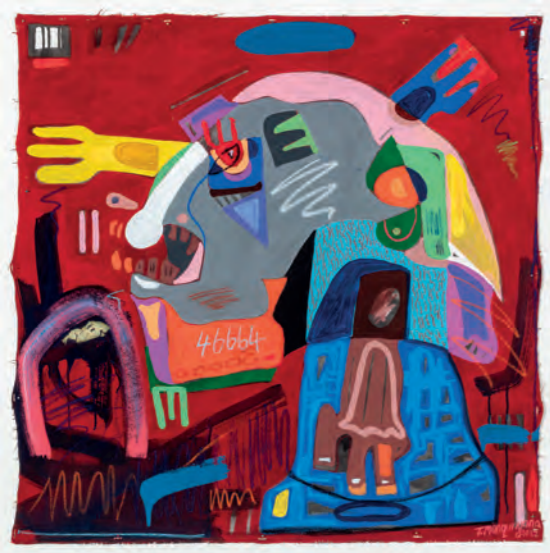
Touch is Move Mixed media on canvas 37 x 36 inches (above)