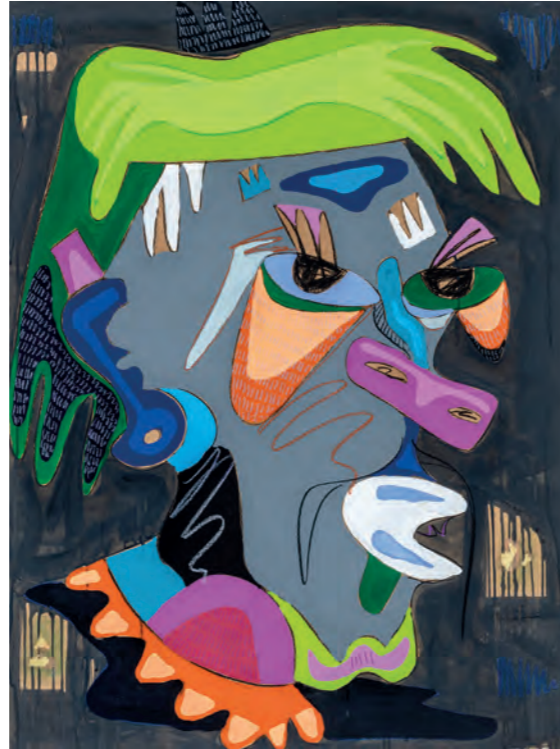
Gucci Man Mixed media on paper 40 x 30 inches