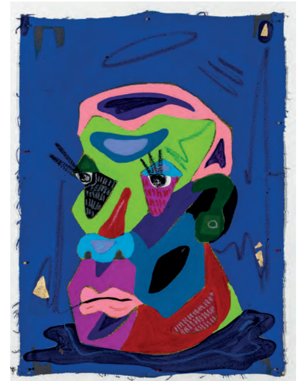
Me, Myself and I - III Mixed media on canvas 20 x 14.5 inches