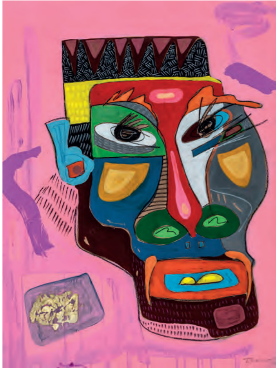
Jazz Man Mixed media on paper 40 x 30 inches