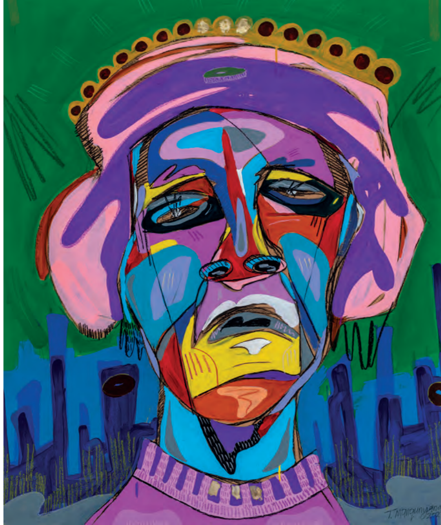
Mother Nature Mixed media on paper 40 x 33 inches