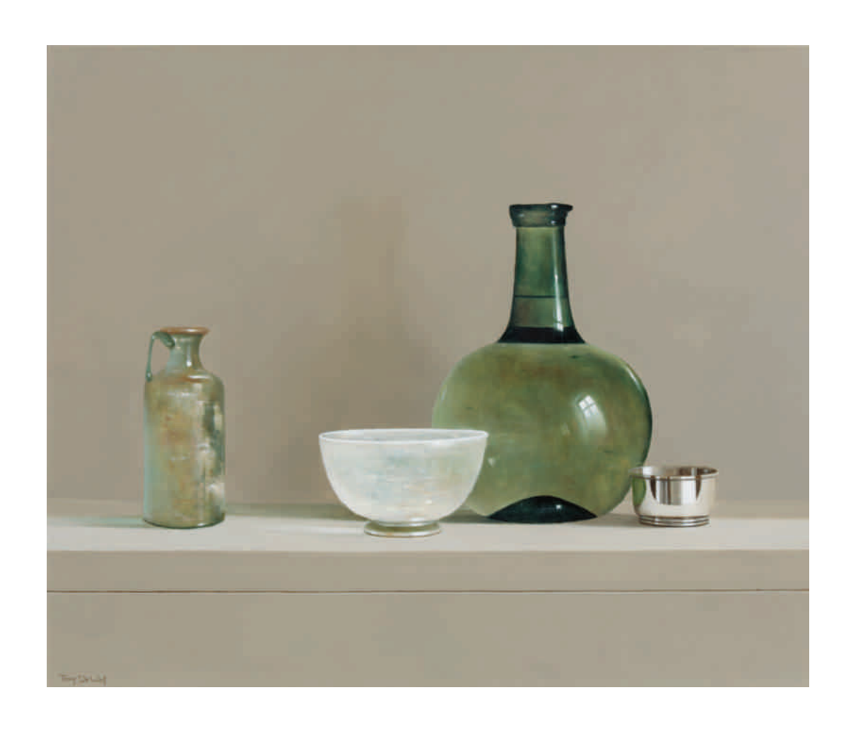
Roman Glass and Silver Cup Oil on board 20 x 24 inches