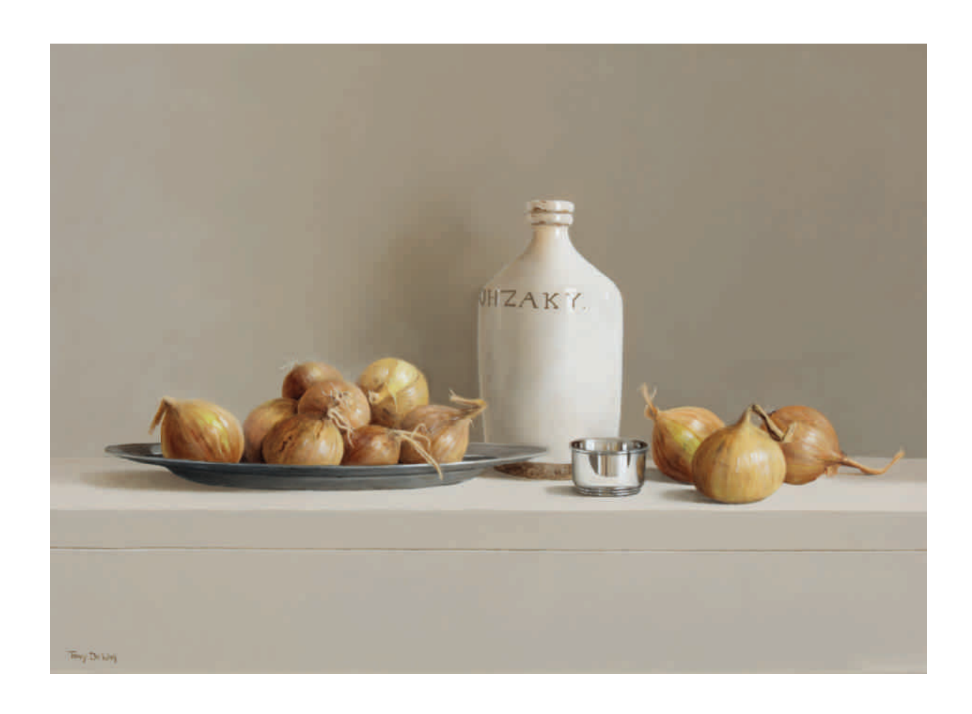
Kitchen Table Oil on board 20 x 28 inches