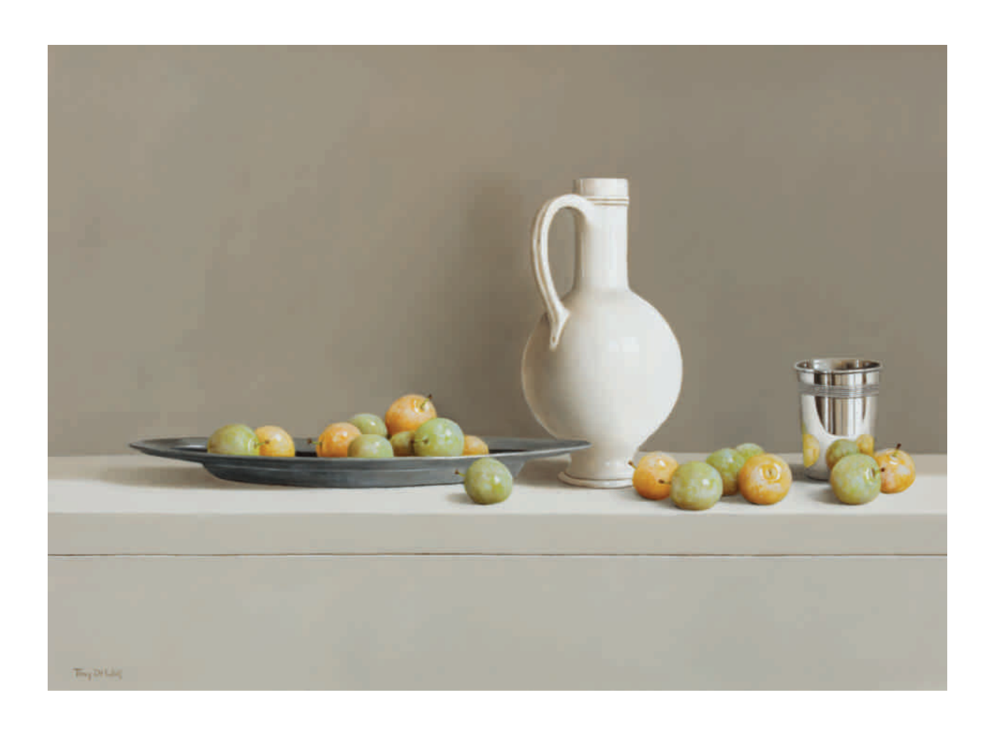
Mirabelle Plums on a Tin Dish, White Stoneware Jug Oil on board 20 x 28 inches