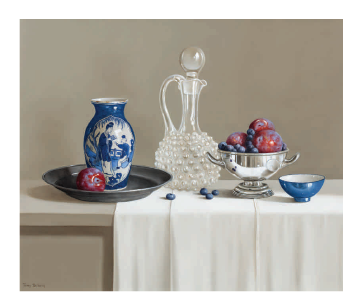
Something Old, Something New, Something Borrowed, Something Blue Oil on board 20 x 24 inches