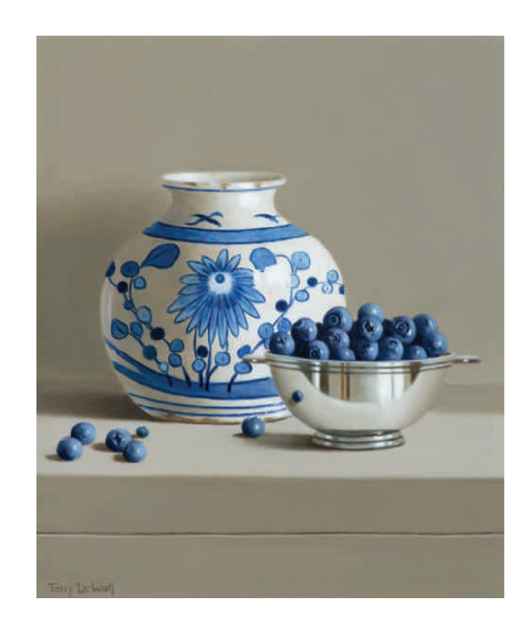
Blueberries Oil on board 10 x 12 inches (Right) Something Old Something New Oil on board 24 x 28 inches