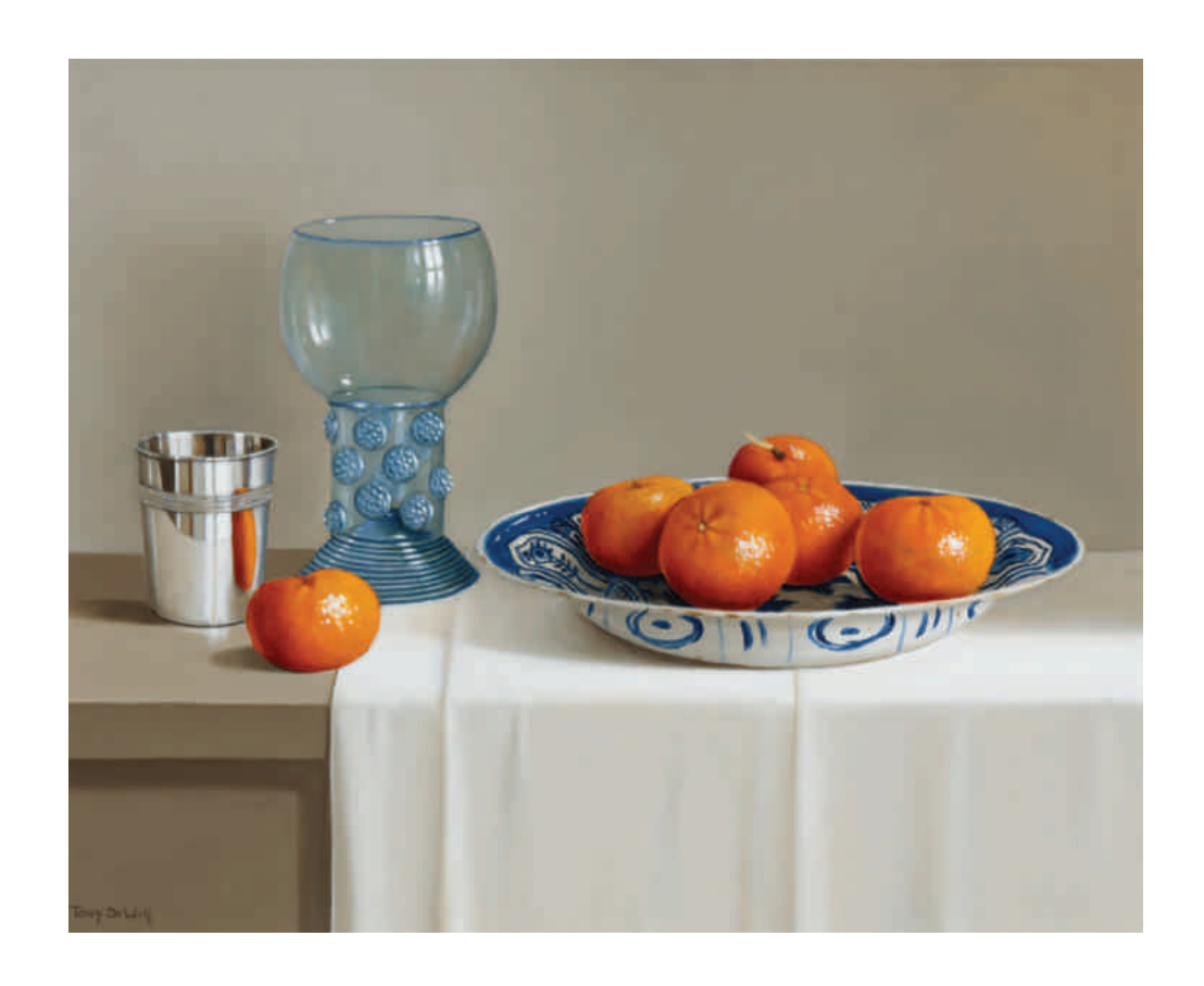
Blue Glass German Goblet, Silver Beaker and Mandarins on a Chinese Dish Oil on board 16 x 20 inches