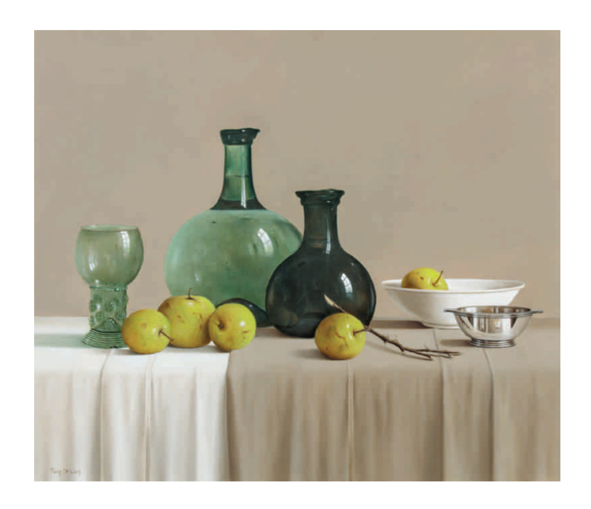
Apples and Green Glass Oil on board 24 x 28 inches