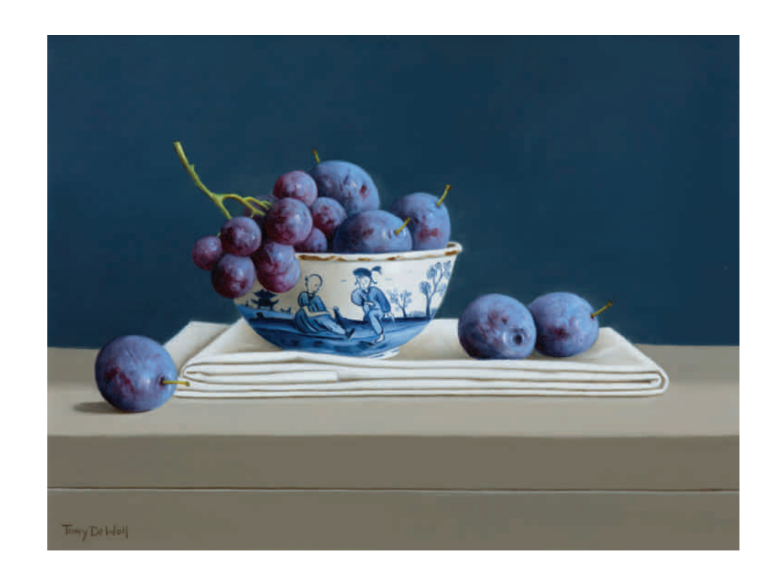
Plums and Grapes in Chinese Bowl Oil on board 12 x 16 inches