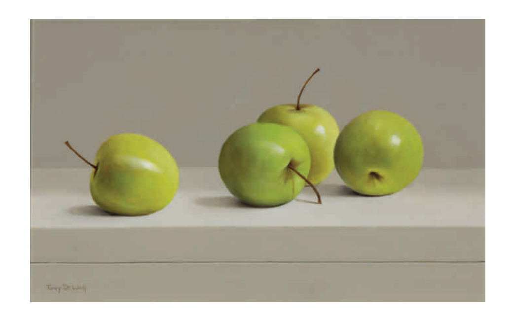
Four Apples Oil on board 10 x 16 inches