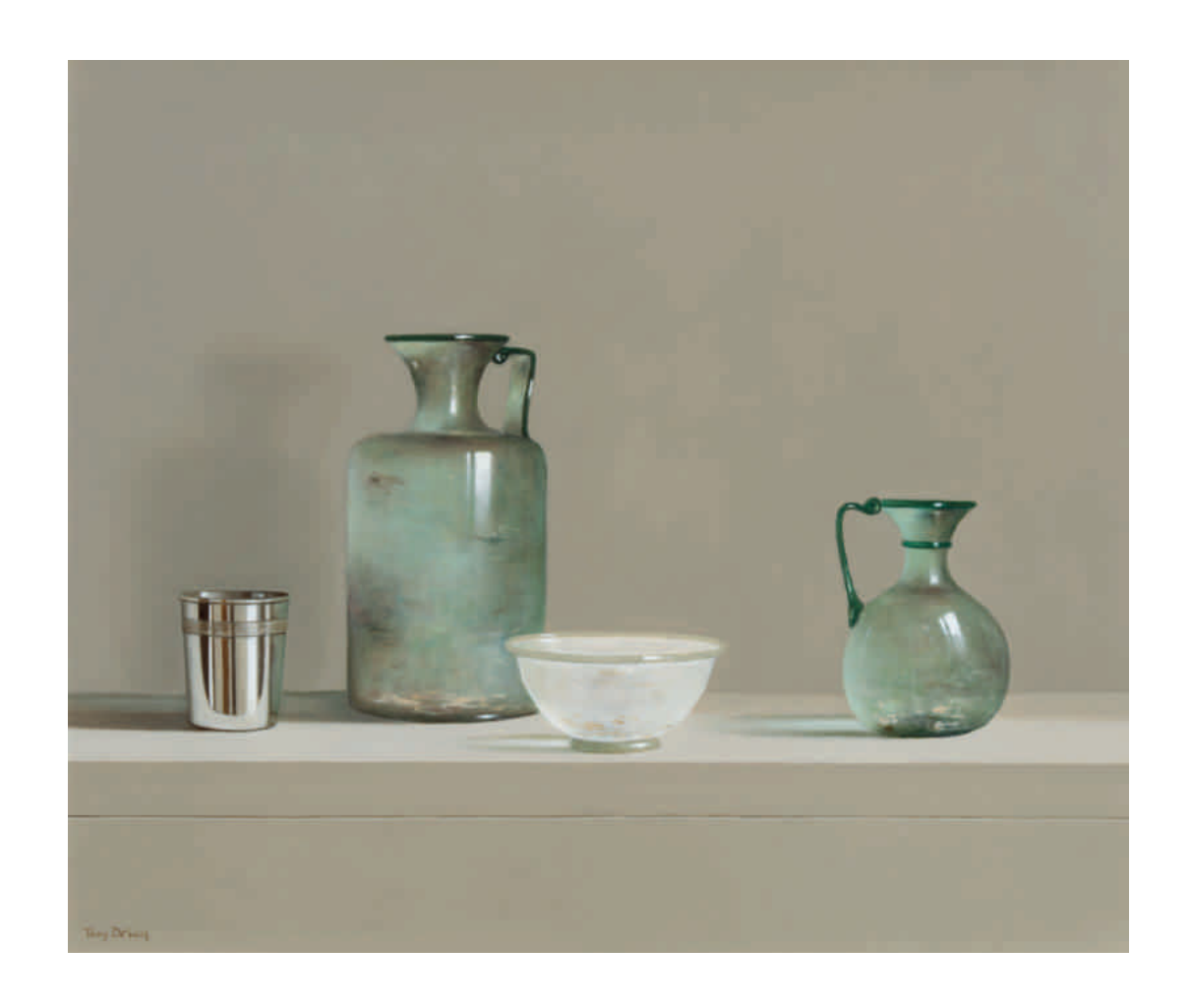
Roman Glass and Silver Beaker Oil on board 20 x 24 inches