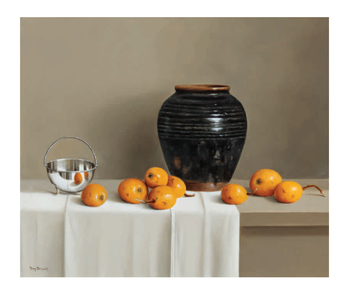
Black Earthenware, Silver and Sharon Fruit Oil on board 20 x 24 inches