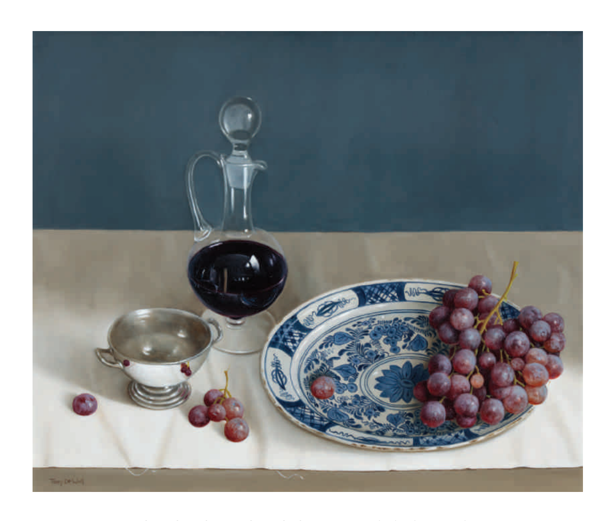
Chinese Plate with Grapes, Silver Bowl and Wine Decanter Oil on board 20 x 24 inches