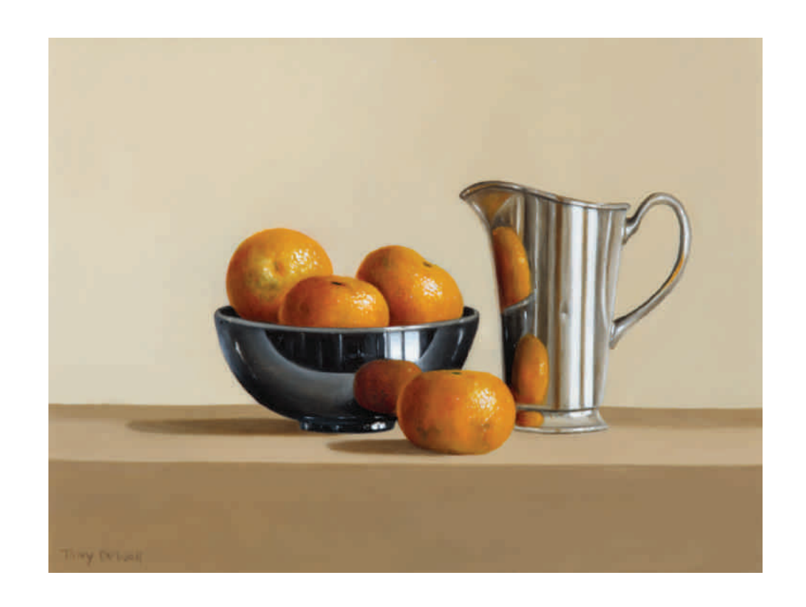
Mandarins in Blue Bowl and Silver Jug Oil on board 12 x 16 inches