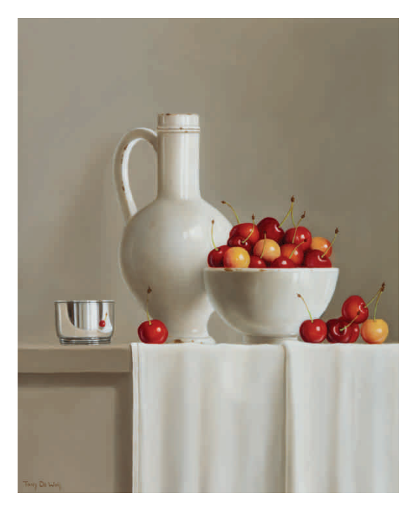
Napoleon Bigarreau Cherries in a White Bowl Oil on board 20 x 16 inches