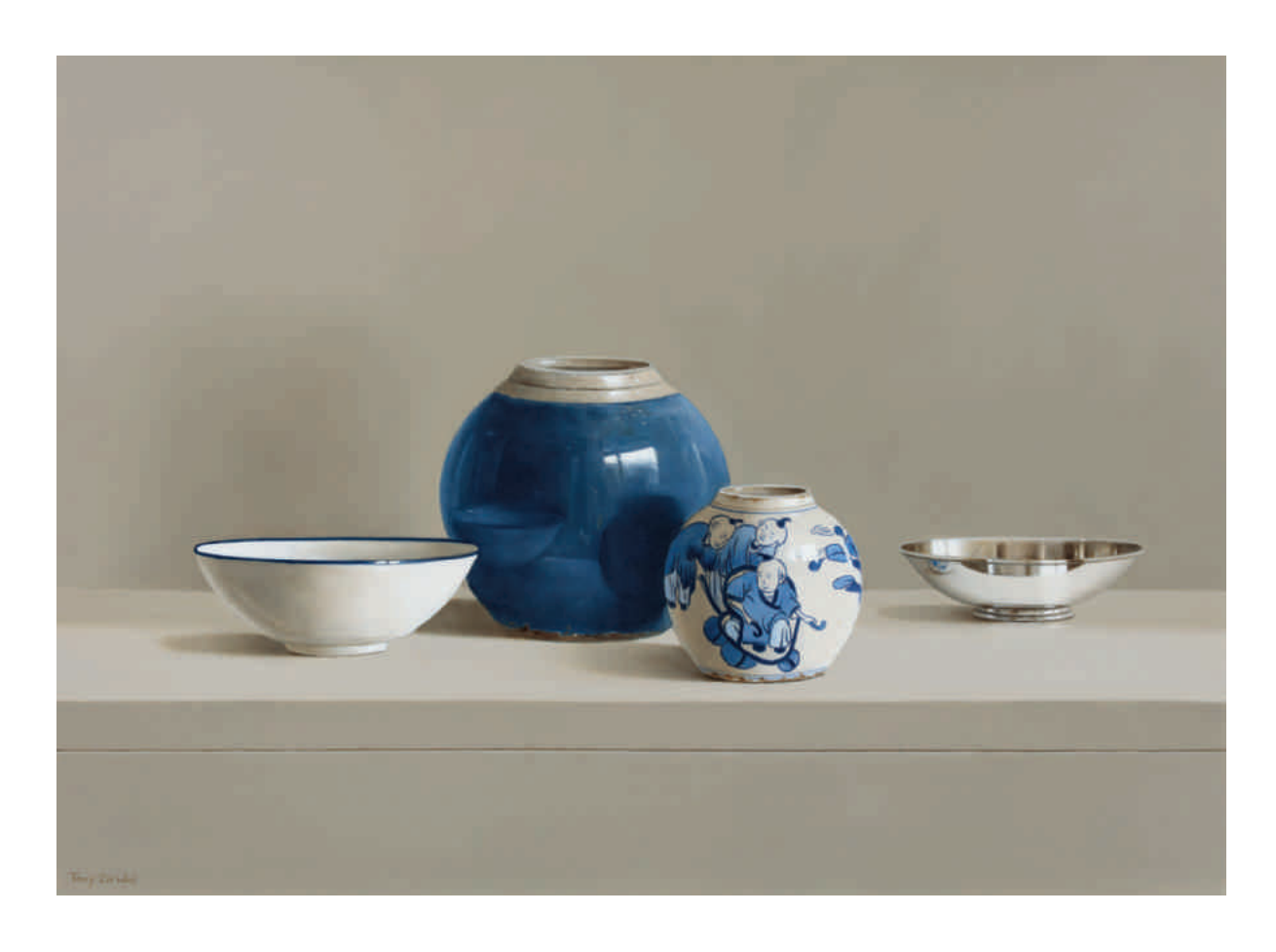
Blue Ginger Jars, White and Silver Bowl Oil on board 20 x 28 inches

(Left) French Earthenware, Wine Decanter, Belgian Blue Plums Oil on board 24 x 32 inches