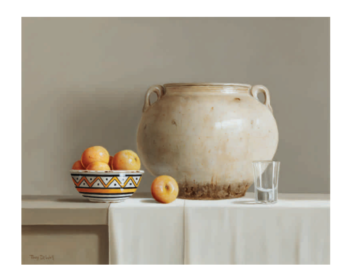
French Provence Pottery and Yellow Plums Oil on board 16 x 20 inches