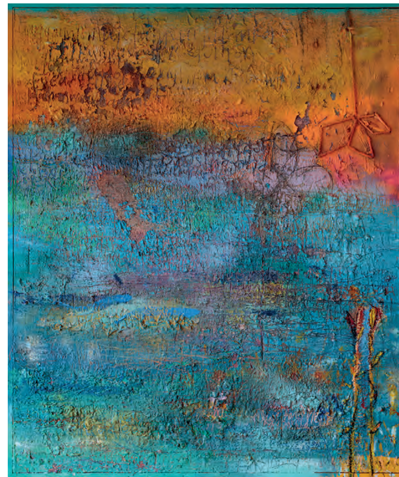
Tapestry Mixed Media on canvas 48 x 41 inches