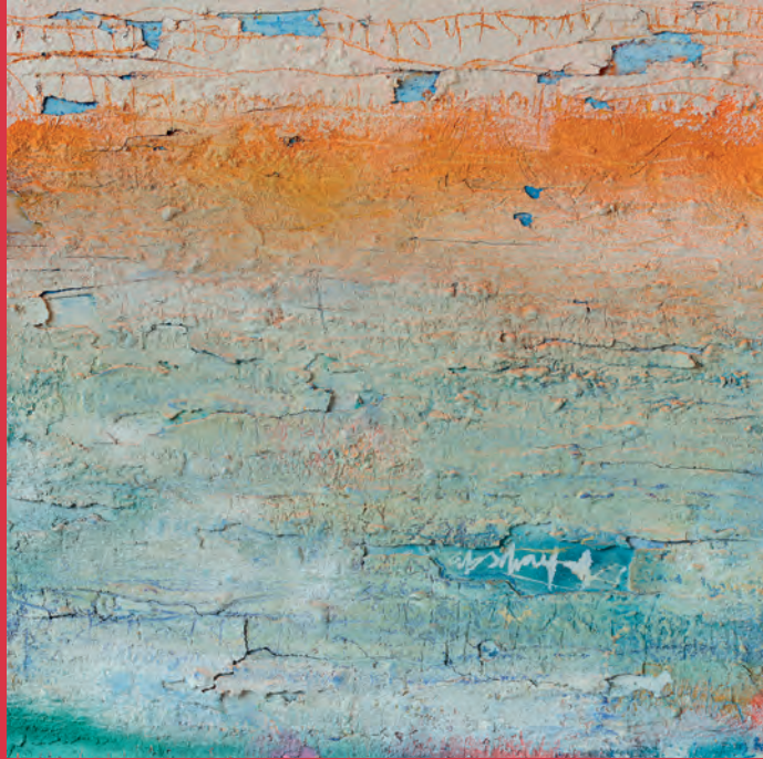
Salt Wata Mixed Media on canvas 24 x 24 inches