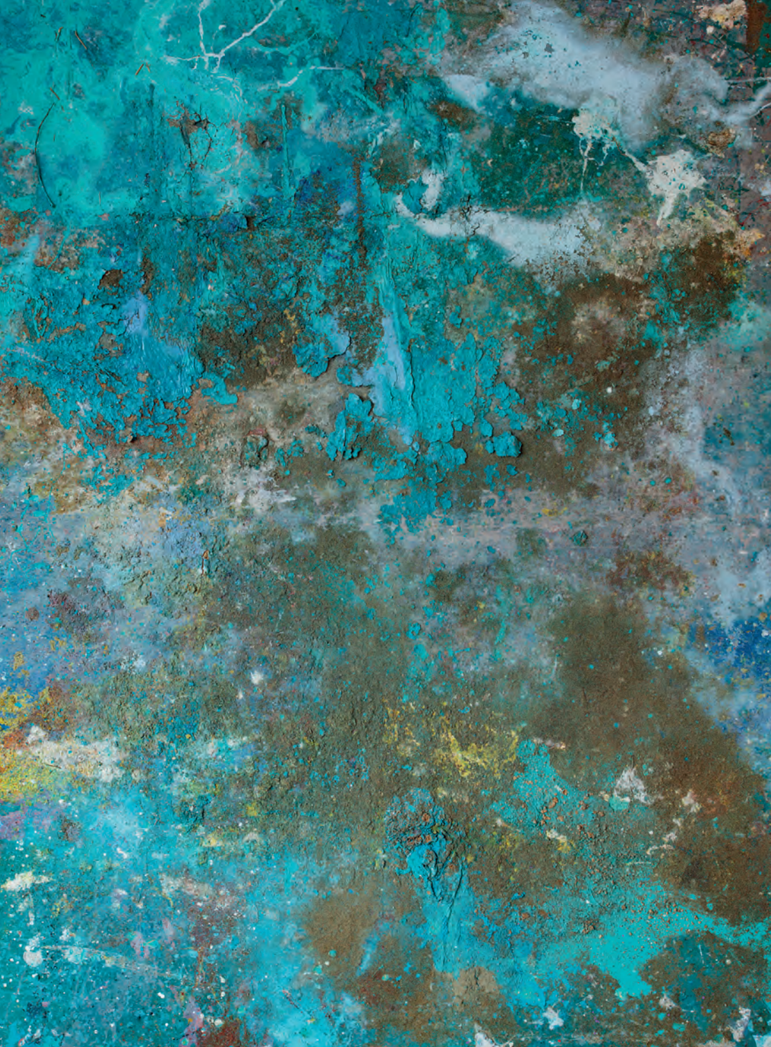
St Thomas, Jamaica 1 Mixed Media on canvas 75 x 55 inches