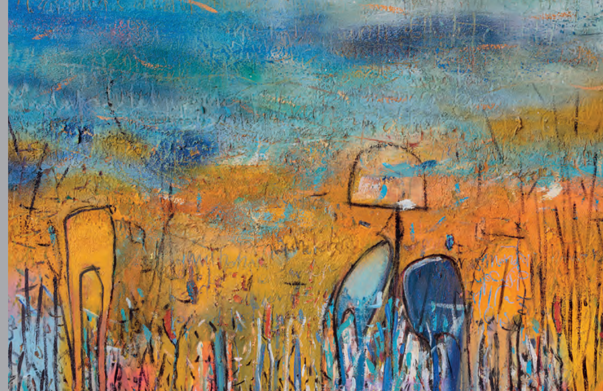
Gleaner Mixed Media on canvas 24 x 36 inches