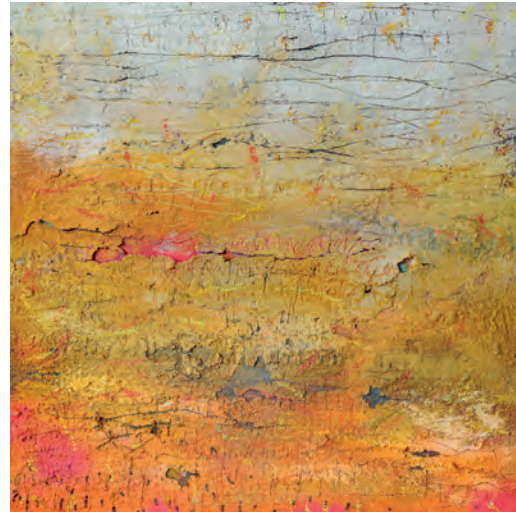
Hot Sun Mixed Media on canvas 24 x 24 inches