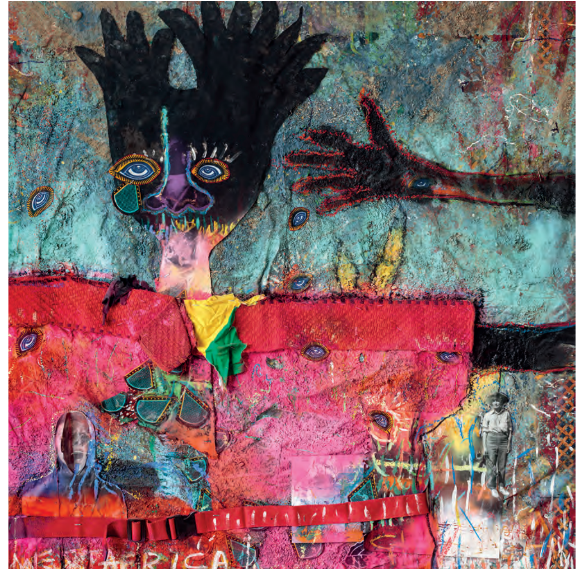
Accompong Mixed Media on canvas 39 x 39 inches