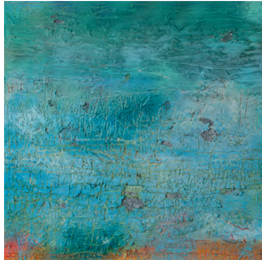
Two faces, one hat Mixed Media on canvas 24 x 24 inches