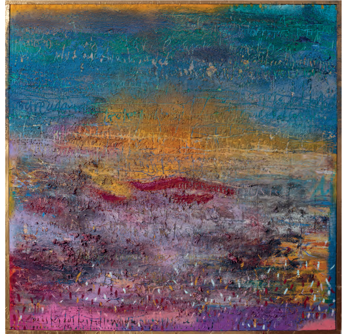
Solitude Mixed Media on canvas 41 x 41 inches