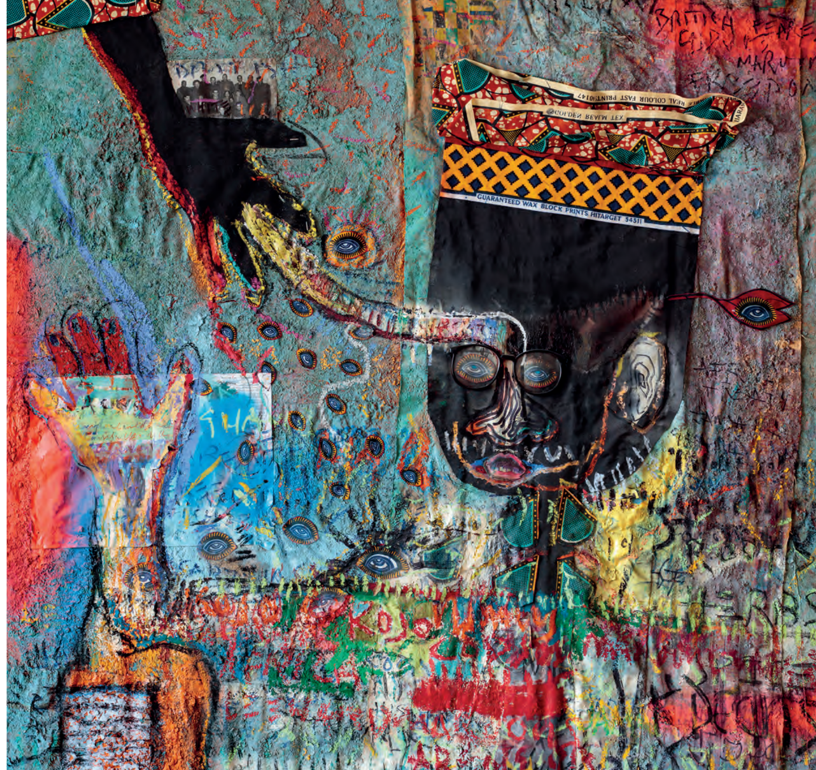
Captain Cudjoe Mixed Media on canvas 39 x 39 inches (right)