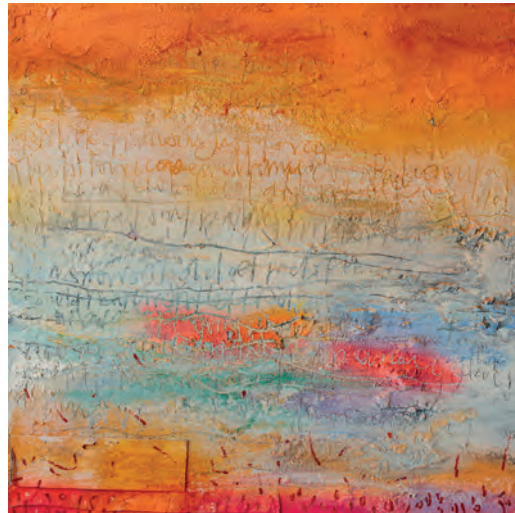
Kick Up Rumpus Mixed Media on canvas 24 x 24 inches