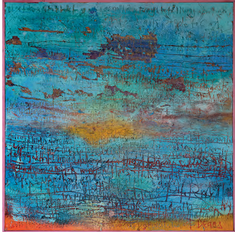
Motherland Mixed Media on canvas 39 x 39 inches