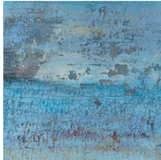
John Crow Mixed Media on canvas 24 x 24 inches