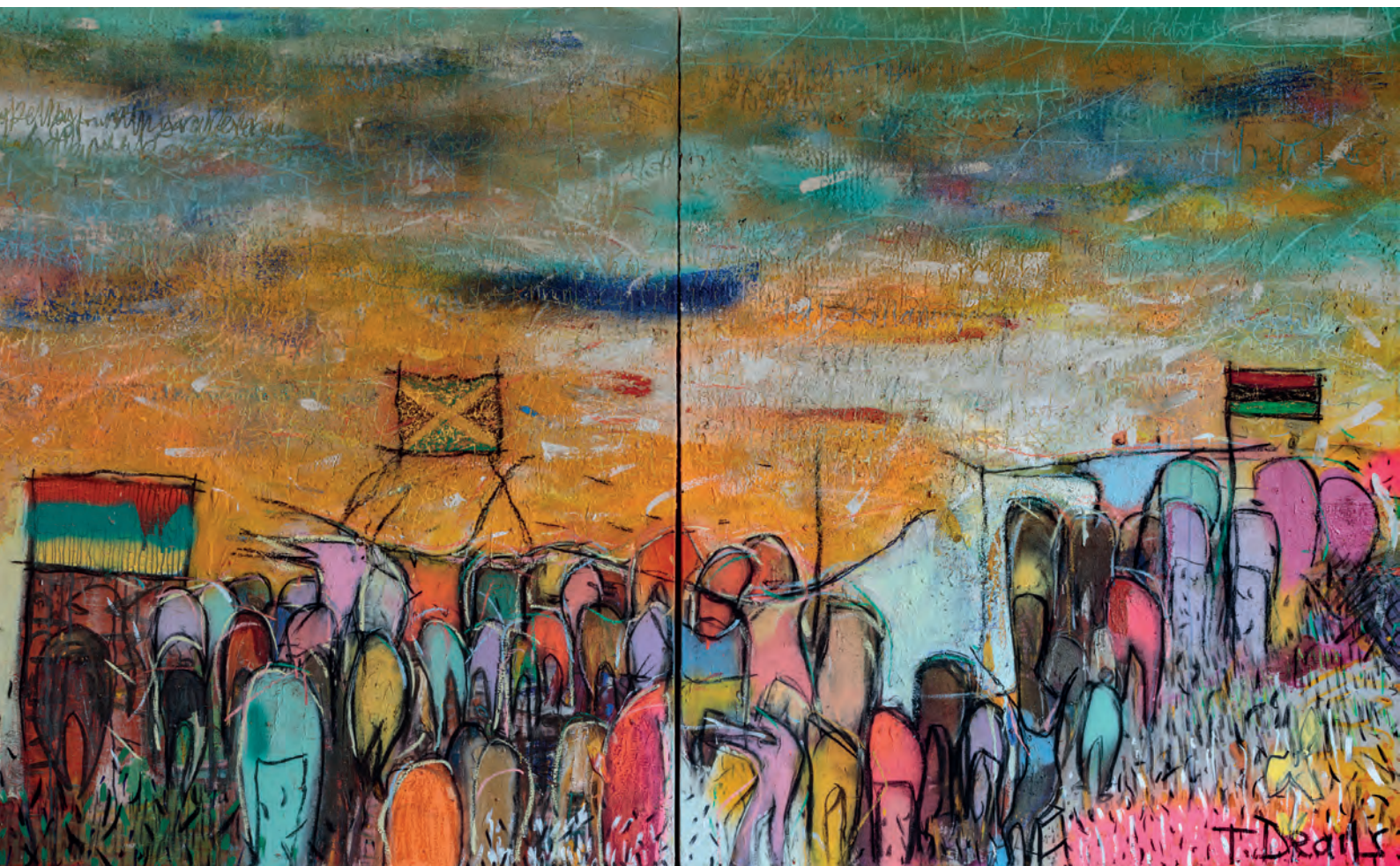
The Marches Mixed Media on canvas 47 x 79 inches