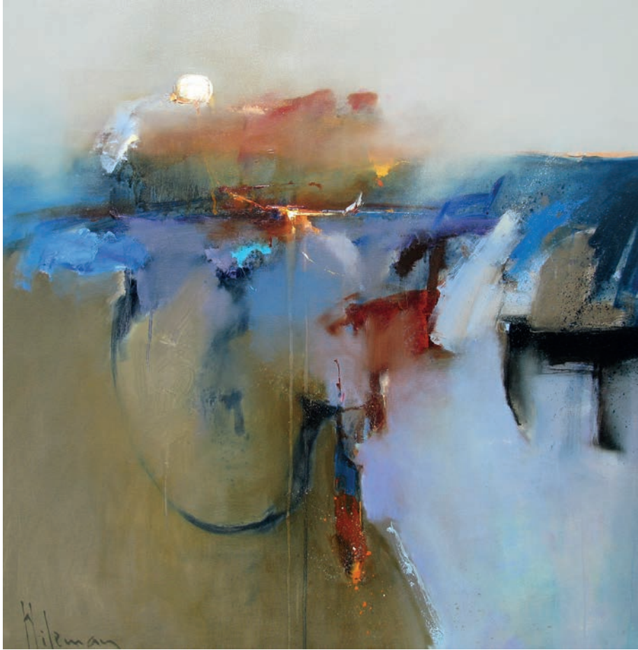
Celestial Tide Oil on canvas 36 x 36 inches