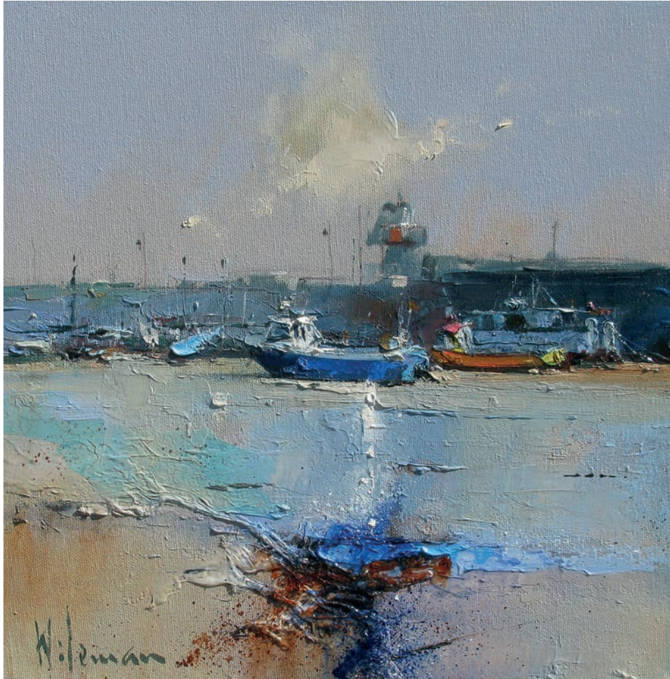
St Ives Oil on canvas 12 x 12 inches