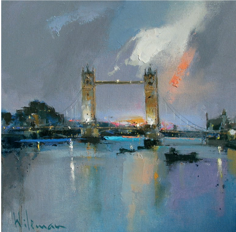
Dawn, Tower Bridge Oil on canvas 12 x 12 inches