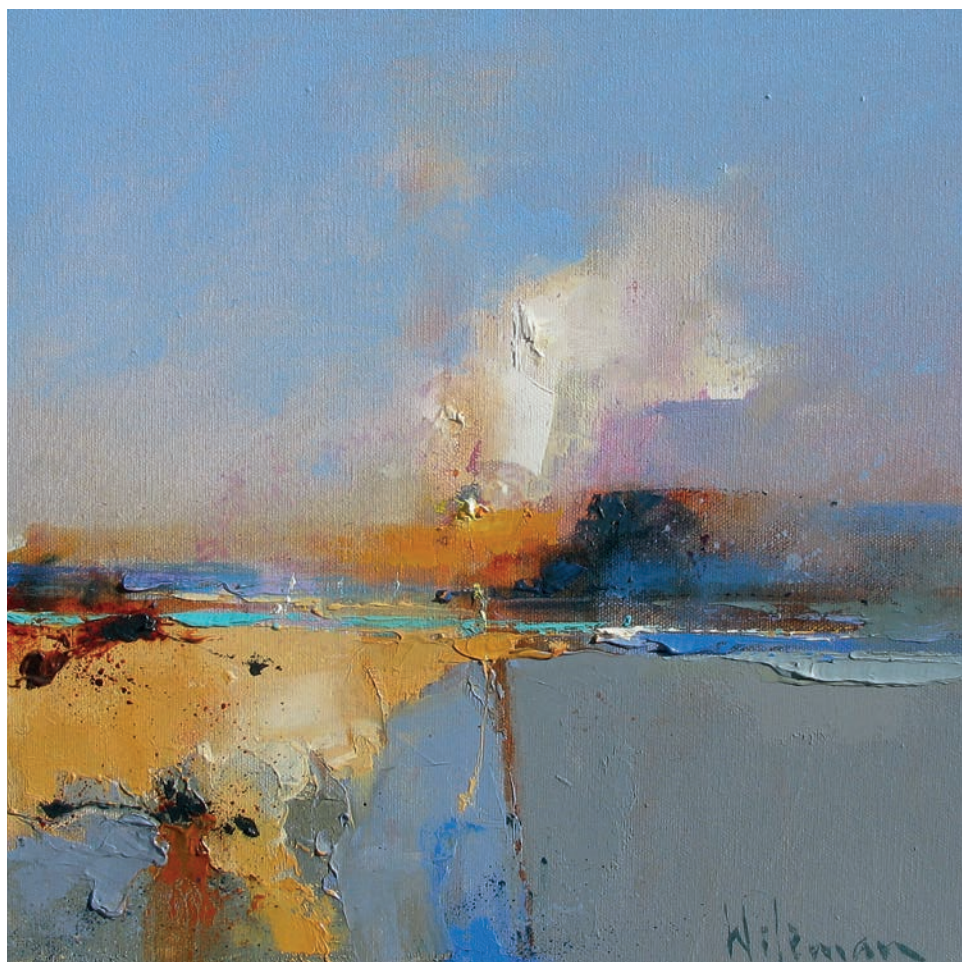
Cloud Burst, Poldhu Oil on canvas 12 x 12 inches