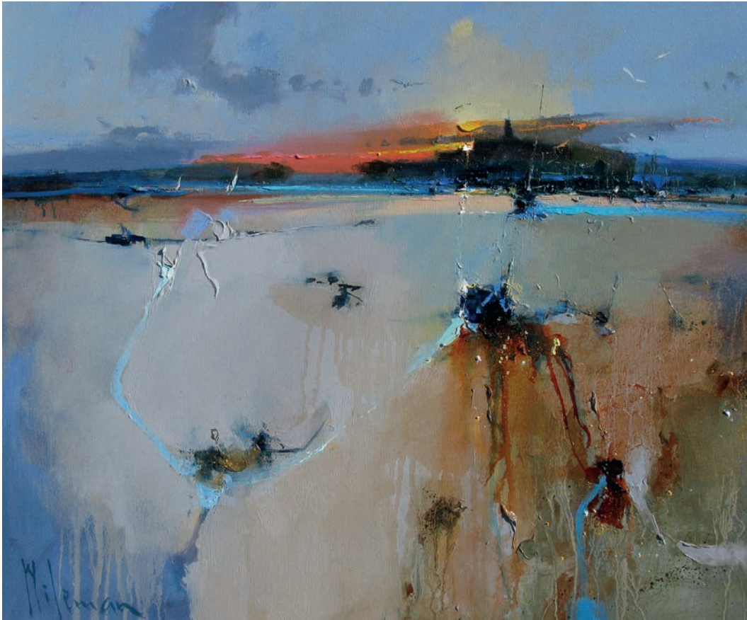
Exmouth Oil on canvas 20 x 24 inches