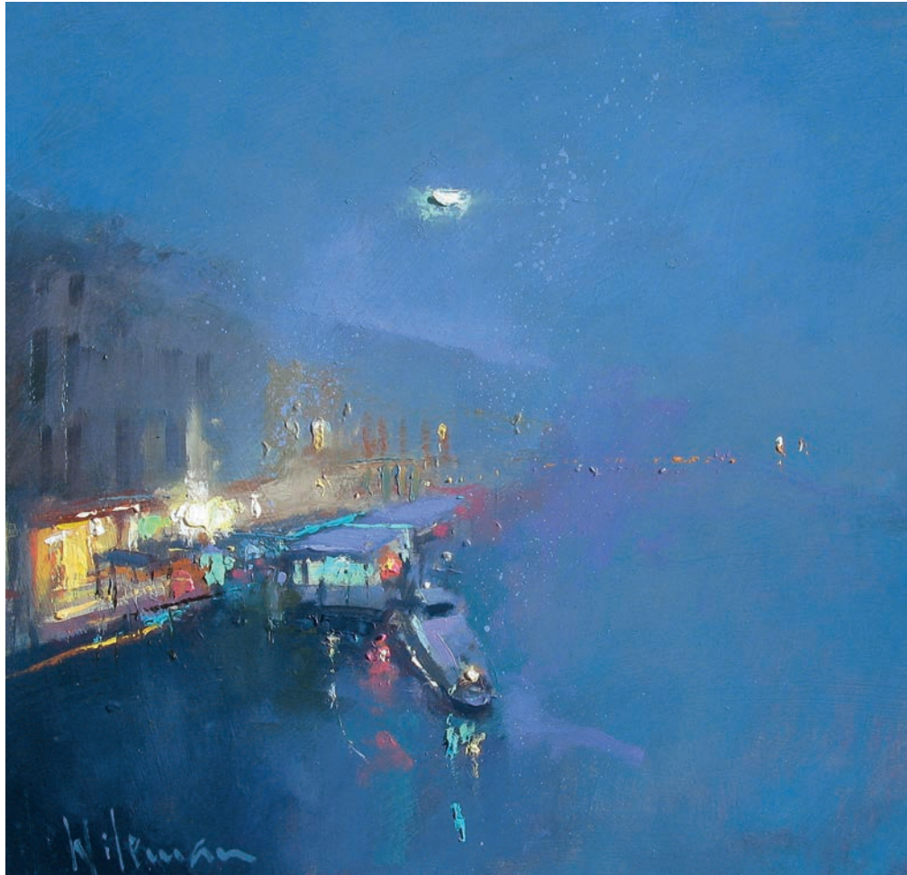
The Vaporetto Oil on board 12 x 12 inches