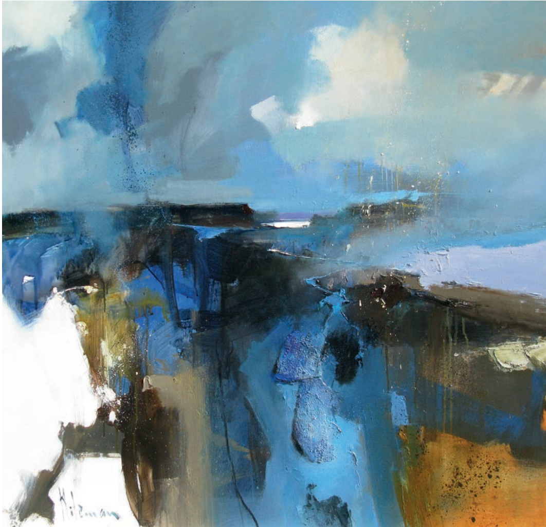
A Journey North, Winter Oil on Canvas 36 x 36 inches