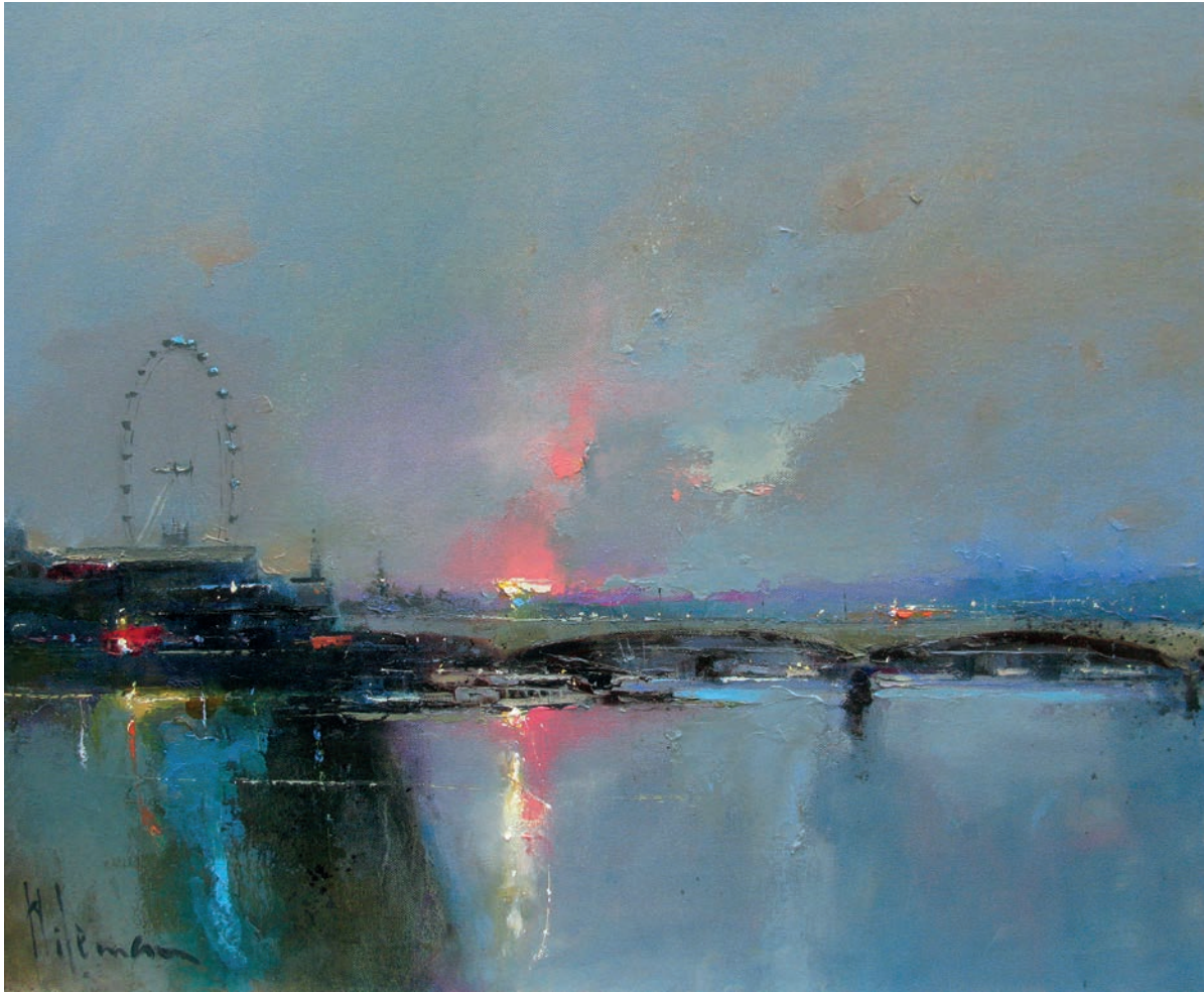
Summer Nights, London Oil on Canvas 20 x 24 inches