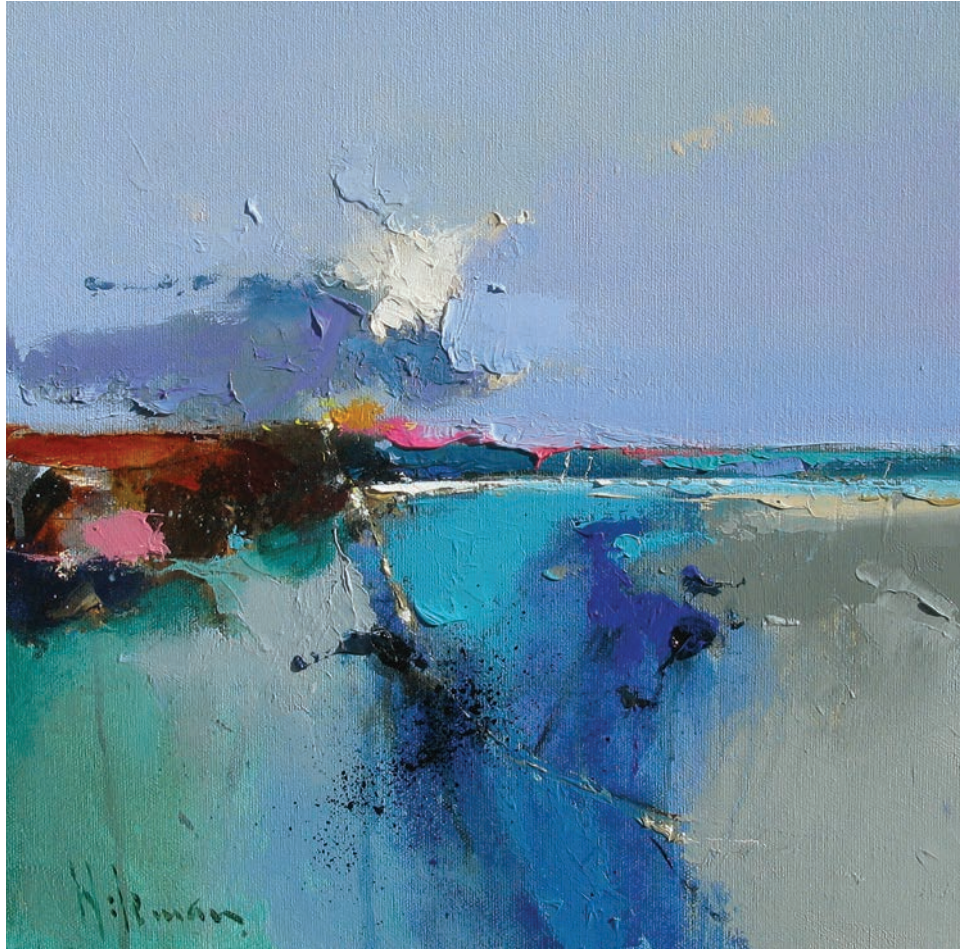
Blue Drift Oil on Canvas 12 x 12 inches