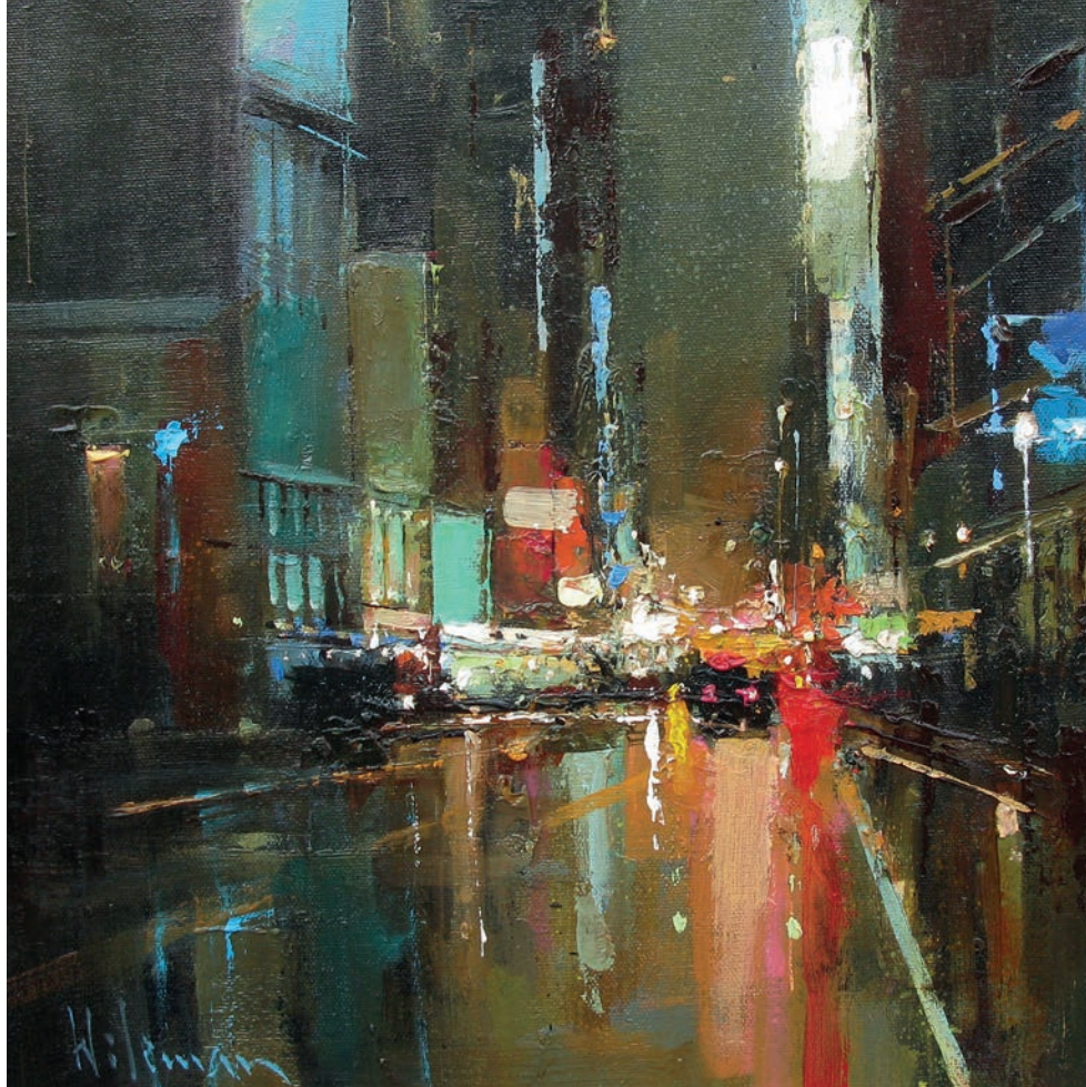
New York in the Rain Oil on Board 12 x 12 inches