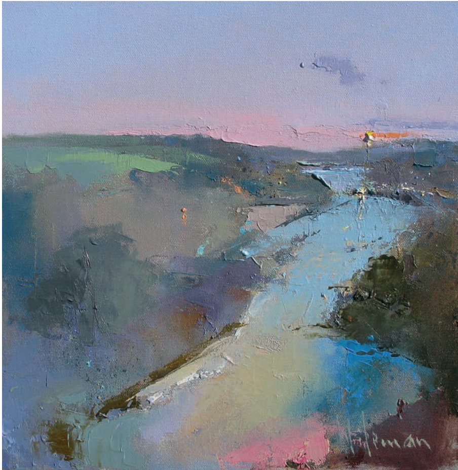
Off the Dart Oil on canvas 12 x 12 inches